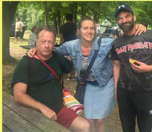
A day for our members at Yamaska Beach! Full of swimming, sandwiches and sun.