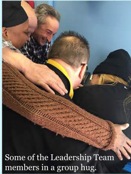
Some of the Leadership Team members in a group hug.

We are truly grateful to each and every member of the Leadership Team for their commitment to helping improve the lives of our Mission community, and for helping to keep our community one that continues to be for the people, by the people.