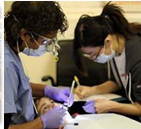
McGill's wonderful Mobile Dental Clinic providing free & much needed dental care for our members.