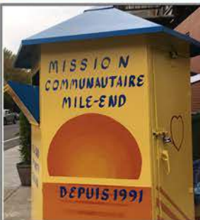
Our donation bin on the corner of Bernard and St-Urbain.

Want to get involved in some of our programming and upcoming events at the Mile End Mission?