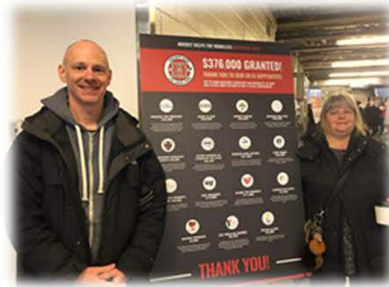
Another amazing Hockey Helps the Homeless Fundraising tournament, aiding homeless & at risk people in so many communities - including ours!