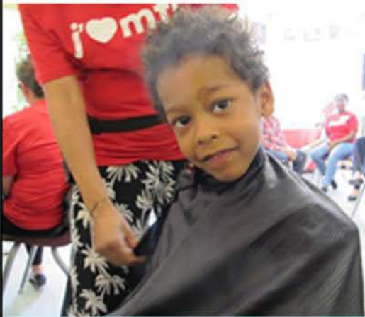
J'aime Montréal pampering both young and old at the Mission with free haircuts, manicures & other special treatments.